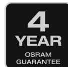
4 year OSRAM guarantee

Vibration resistant, environmentally friendly, and cost-efficient