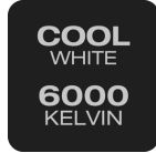
6000K & Cool White

The NIGHT BREAKER LED family - OSRAM's first street-legal1) LED retrofit lamps.