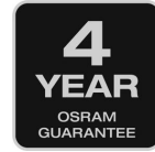
4 year OSRAM guarantee

Vibration resistant, environmentally friendly, and cost-efficient