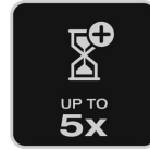
Up to 5 times longer lifetime3)

See and be seen with OSRAM. Cool white color temperature similar to daylight. For more safety on the road, especially when driving at night