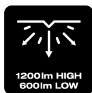
Up to 1200lm (high) & 600lm (low)

Up to 4.5h operating time. Rechargeable via USB-C port with a charging time of only approx. 3 hours